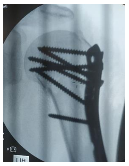
Figure 1f. A blocking plate is mounted along the outer surface of the humerus and secured using screws.

Under the X-ray television device, a blocking plate was placed along the outer surface of the humerus and tightened using screws (Fig. 1f).