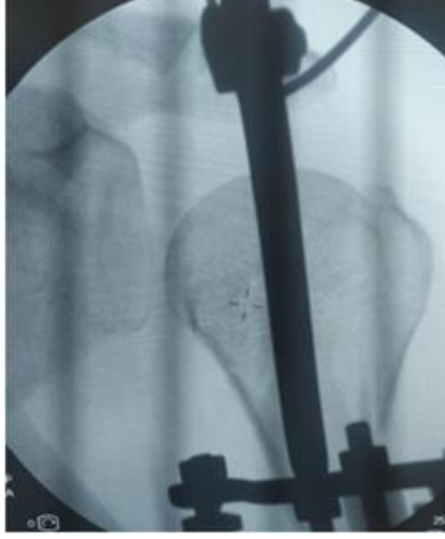
Figure 1b. – distraction to the fractured area using an external distraction apparatus to the shoulder joint c. - anterior posterior projection x-ray of the shoulder joint: given distraction by external apparatus and the presence of bone fragments is satisfactory.

A skin incision of 4.0 cm in size was made on the outer surface of the shoulder joint, the wound layer was opened, hemostasis. Because the proximal portion of the humerus in the revision contained multiple fragmented fractures, atraumatic sutures were performed from the junction of the shoulder rotator cuff muscles attached to the bone fragments and ideally repositioned (Figures 1d, e).