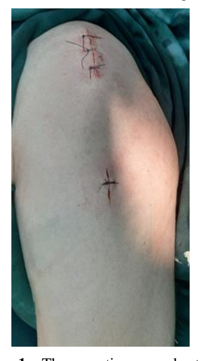
Figure 1g. The operation wound sutured.

The external distractor apparatus was dismantled after we were satisfied that the placement of bone fragments in the X-ray television device was satisfactory. The operation wound was sutured layer by layer. The duration of the surgical procedure was 45 minutes (Fig. 1g).