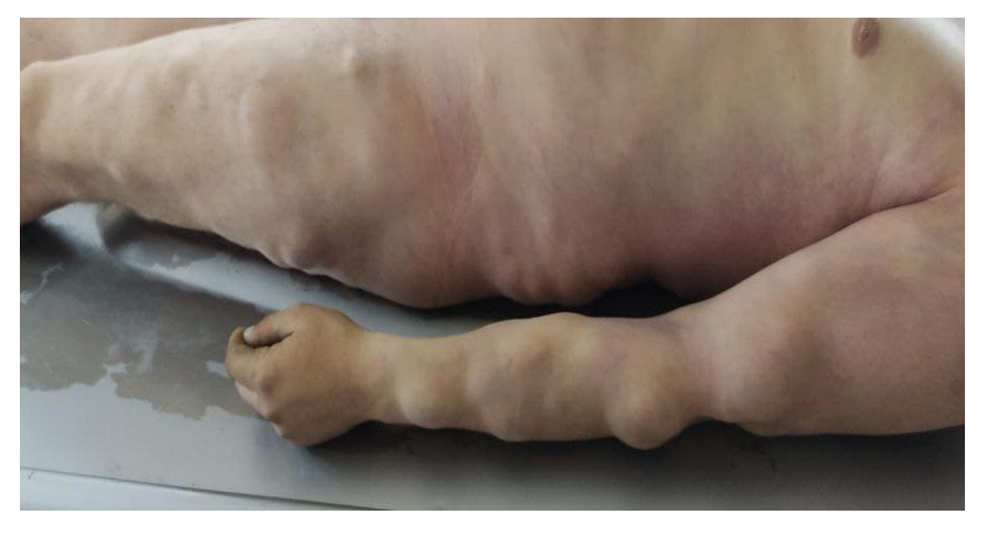
Fig.1 (b). Macroscopic appearance of neurofibromatosis.