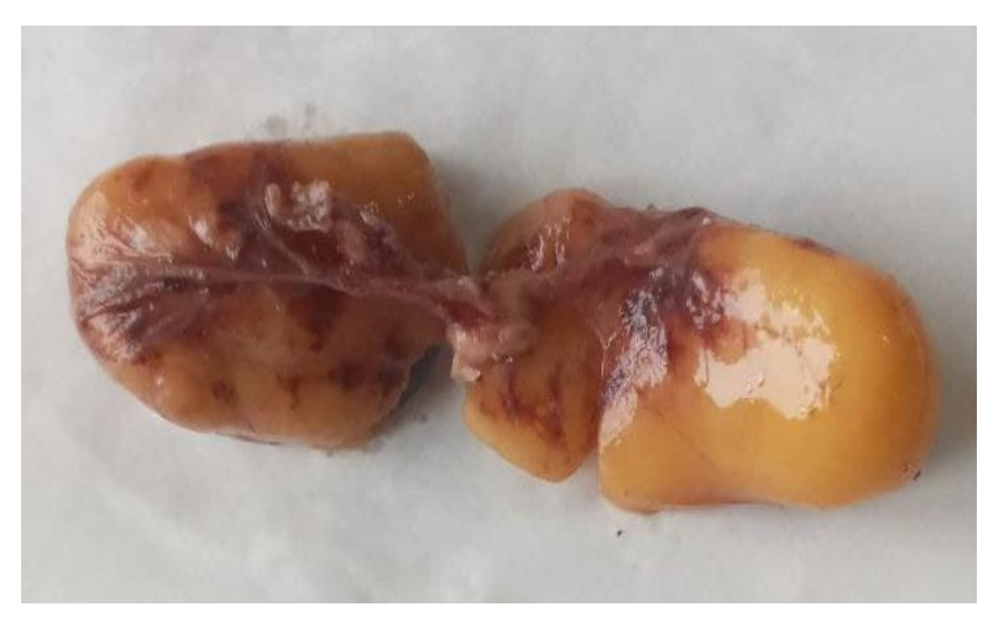
Fig.2 (a). Material obtained during autopsy.