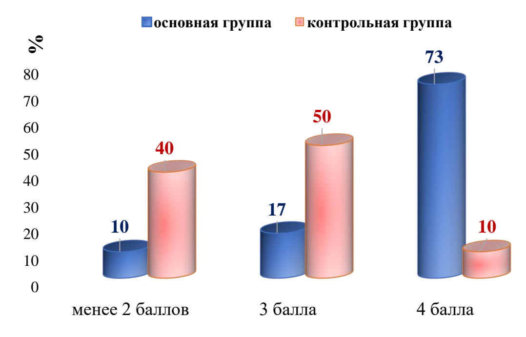
Figure 1. Results of adherence assessment using the Morisky-Green scale in patients after 3 months of therapy.

The number of adherents to therapy was 73% in the main group, while in the control group it was only 10%. Observations of the dynamics of hemoglobin growth in the study groups showed that in the main group there was a higher level of its monthly increase in the blood (Fig. 2). By the end of 3 months, in the main group the hemoglobin level averaged 121 g/l, while in the control group it was 111 g/l.