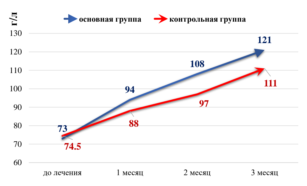
Figure 2. Results of determining the hemoglobin level of patients over time.