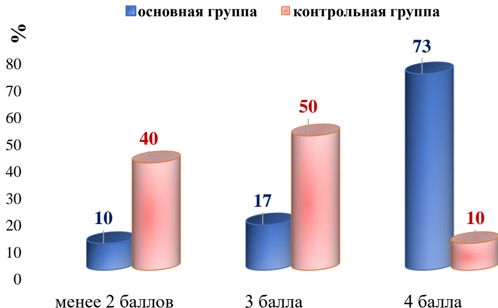
Figure 1. Results of adherence assessment using the Morisky-Green scale in patients after 3 months of therapy.

The number of adherents to therapy was 73% in the main group, while in the control group it was only 10%. Observations of the dynamics of hemoglobin growth in the study groups showed that in the main group there was a higher level of its monthly increase in the blood (Fig. 2). By the end of 3 months, in the main group the hemoglobin level averaged 121 g/l, while in the control group it was 111 g/l.